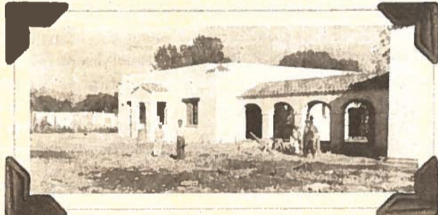
Construction underway at the current site