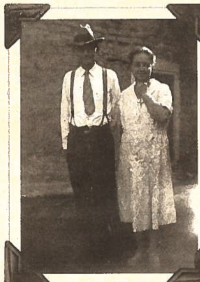
The Graham family owned the funeral home until 2007.